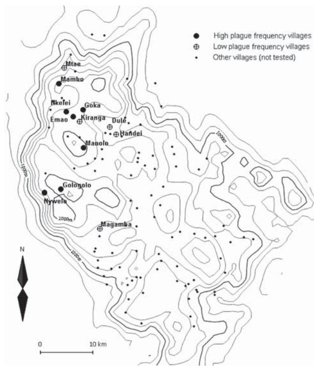
Figure 1. Map of the Lushoto District of Tanzania showing locations of villages with high and low plague frequency. All other villages with known locations are also plotted. The solid lines represent altitude contours (200-m elevation lines). To the west, a steep escarpment demarcates the edge of the district.

We calculated the P. irritans index ( Pii ), per village per month, as the average number of P. irritans collected in a house. Frequency and incidence are village-specific characteristics based on long-term data, while for Pii we had to rely on relatively sparse and heterogeneous sampling during a short period. Simple averaging and testing for a correlation may be misleading if findings vary between days, months, or years. Therefore, we analyzed the relation with a mixed model that included these sources of temporal variation in Pii (first applying a log transformation to ensure normality). This model included \log(Pii) as the dependent variable and frequency or \log(\text{incidence}) as the (continuous) independent factor. Year and month (nested within year) were added as fixed effects, while village and the year–village interaction were treated as random effects to control for temporal variation in Pii , as well as for the fact that village is the independent unit of observation. Correlations in day-to-day estimates of Pii were modeled by using an autoregressive correlation coefficient. Model selection was based on backward elimination of nonsignificant fixed effects. All random effects were retained in the model to ensure appropriate weighting and approximation of degrees of freedom by using the Kenward-Roger method.